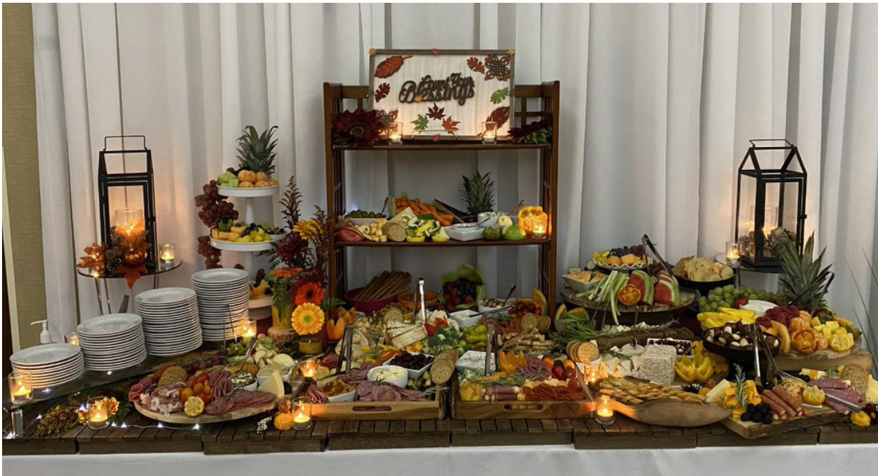
Spectacular Charcuterie Display! (See page 6 for details and pricing)

Check out our reviews on Google, The Knot, Wedding Wire, Facebook, and our website!